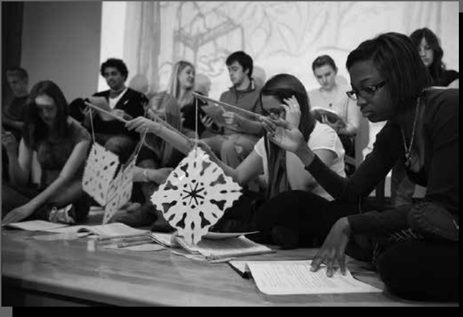
The "flower chorus" creates a snowstorm